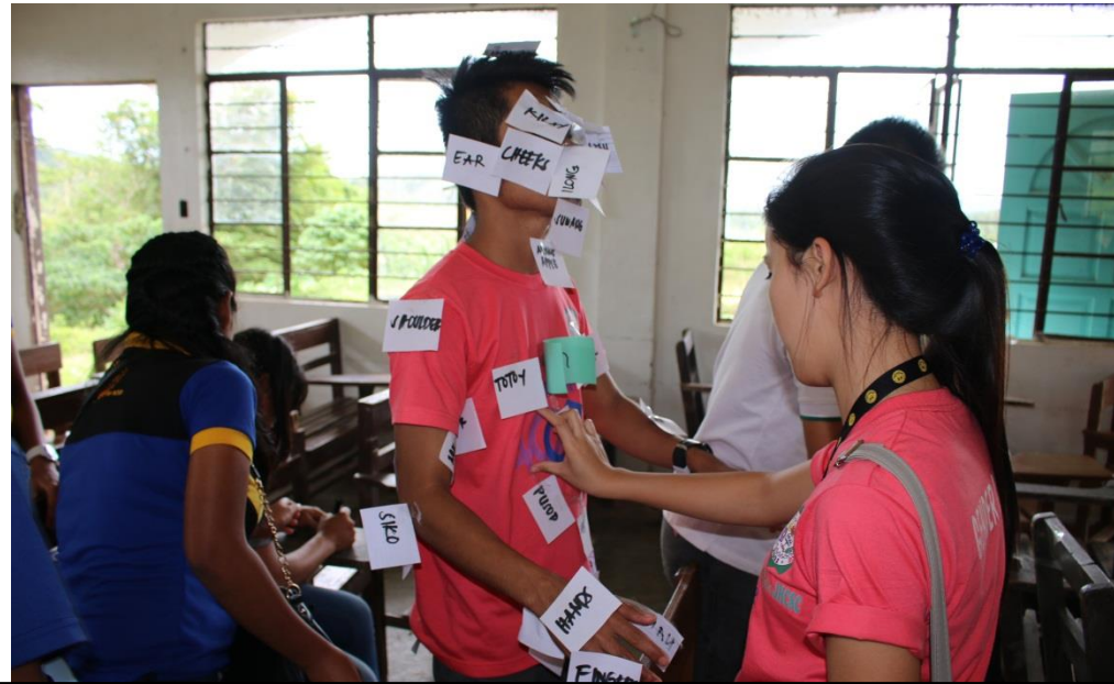
The participants busy do the first activity on identifying their body parts to be written on the peace of paper to be pasted on it.