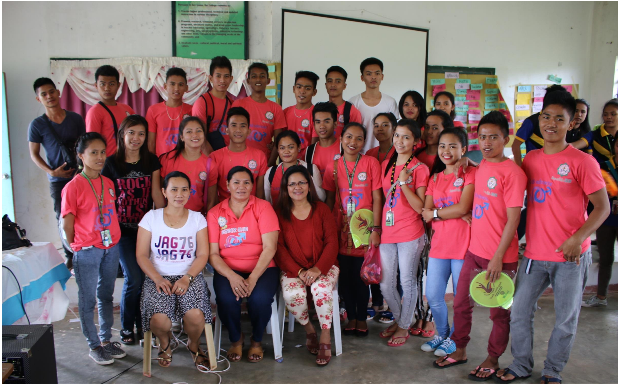
The photo opps by the participants and facilitators and speaker