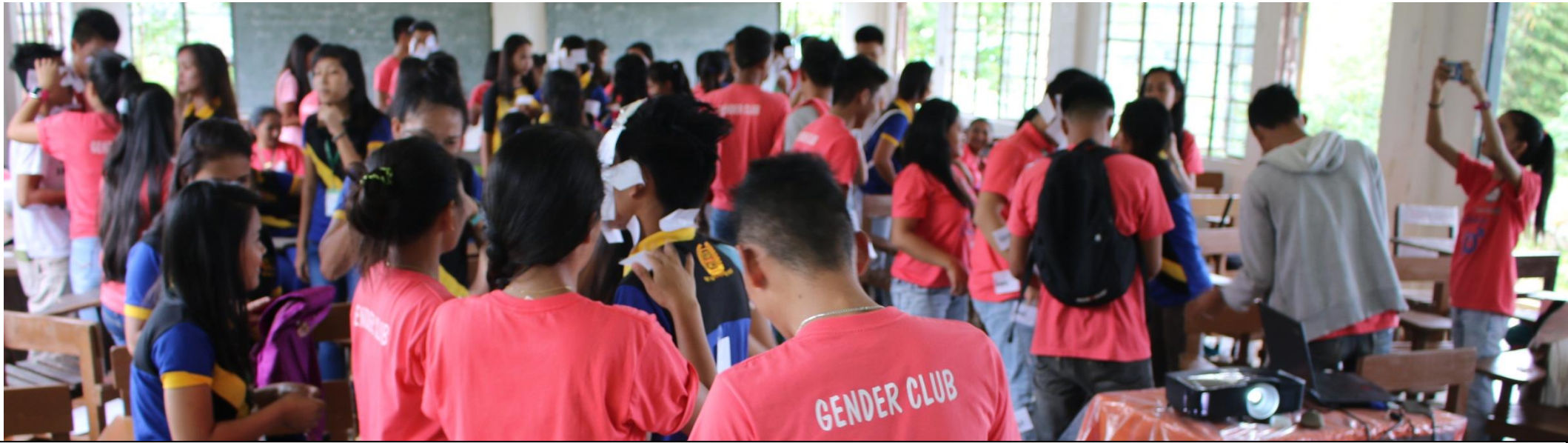
First Activity: Identification of body parts