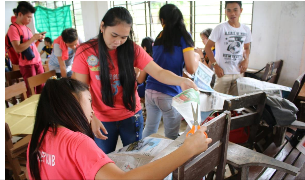
Second Activity: Gender Issues (cut outs the gender issue from the given newspaper and to be place on the Manila paper)