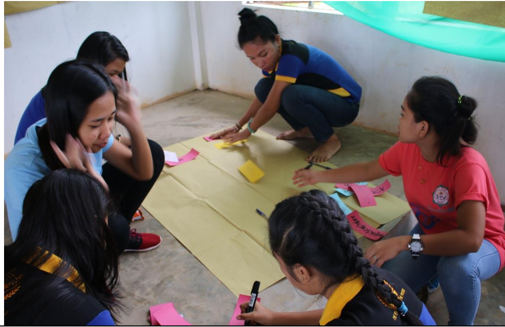
Third Activity: Classifications of Things/ belongings (Male, Both and Female)