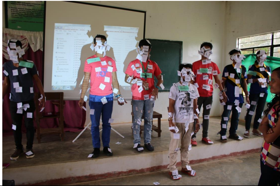
The participants were ready for their presentation of their outputs.