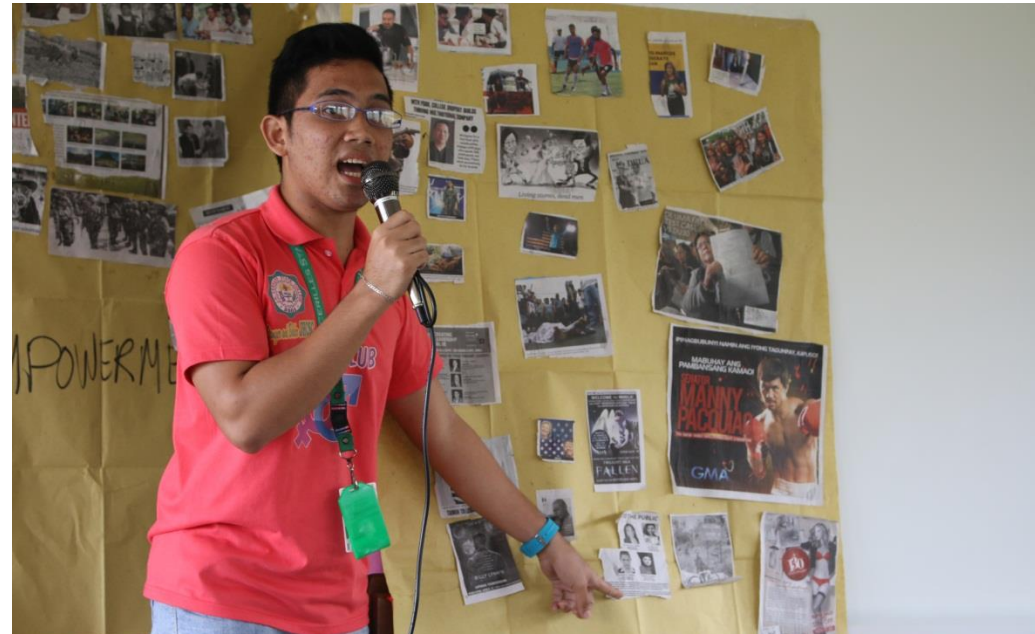
The participants were ready for their presentation on different activities.