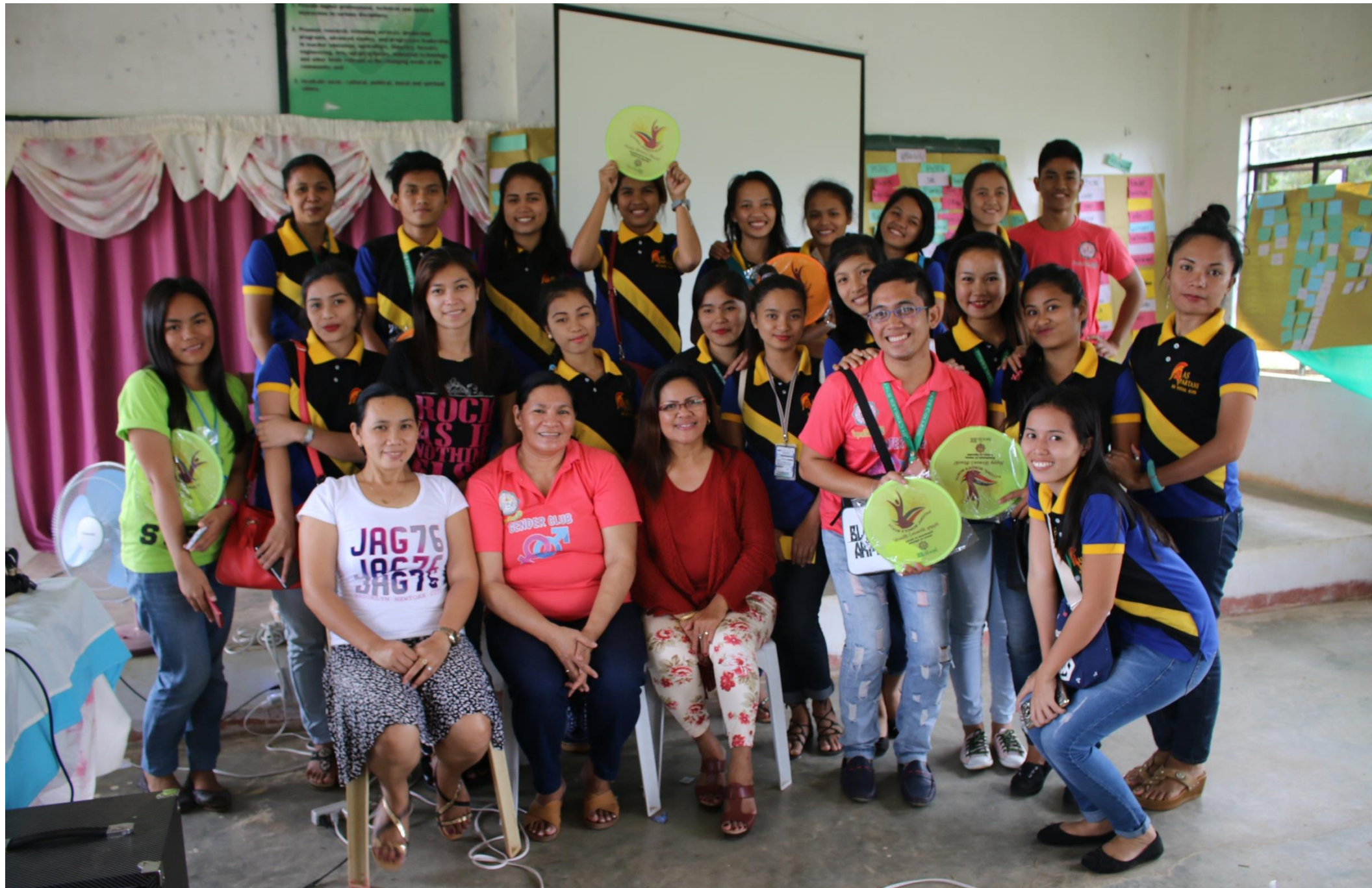
The photo opps by the participants and facilitators and speaker