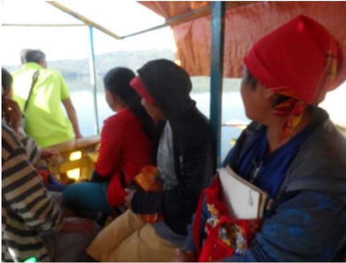
Going to Sitio Sawa, Sitio Pulantad and Sitio Logon together with the Barangay Captain and the member of Dlibun Thindigan Subanen Organization.