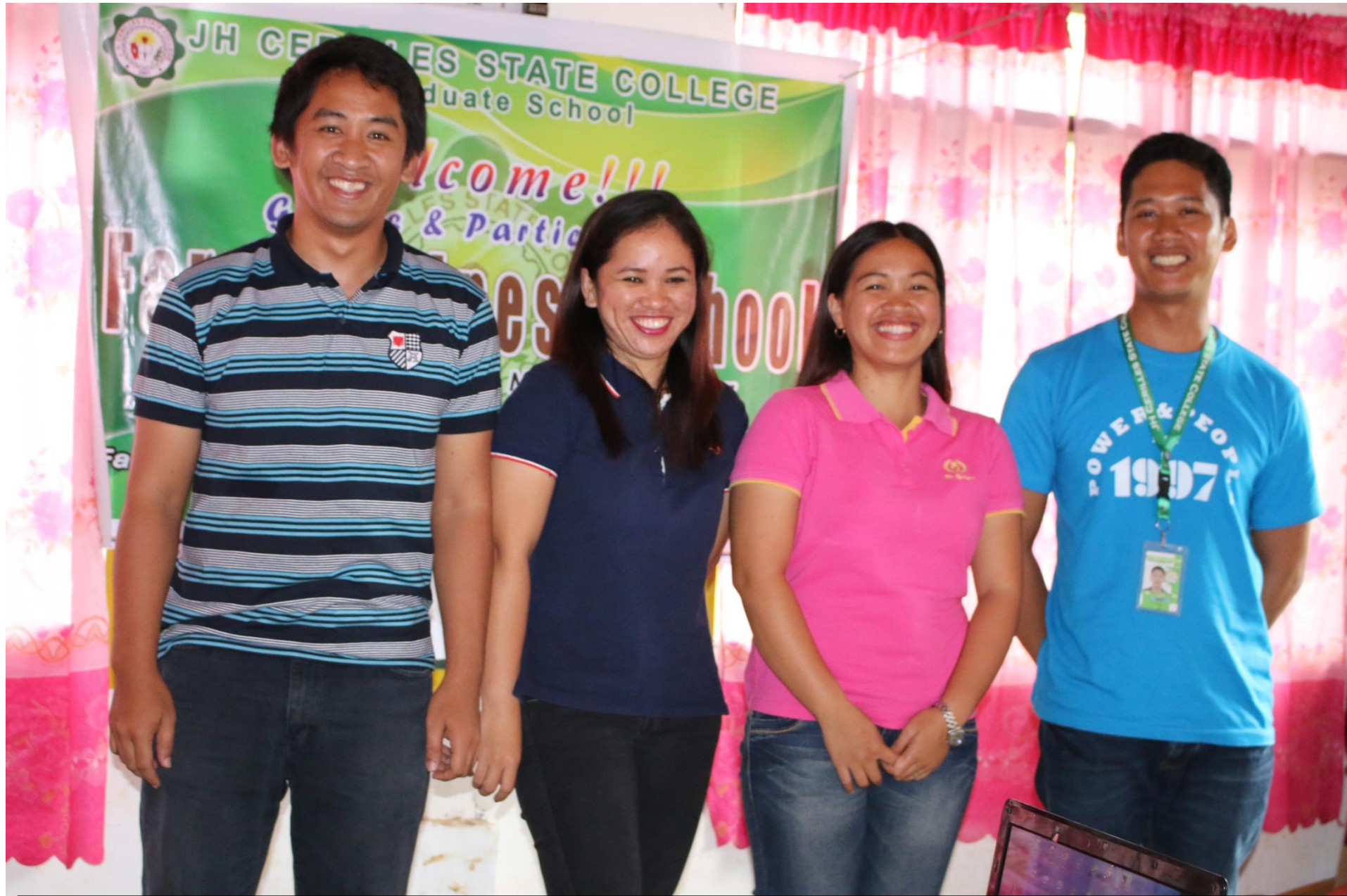
The Lecturers during the Farmers Business Program.