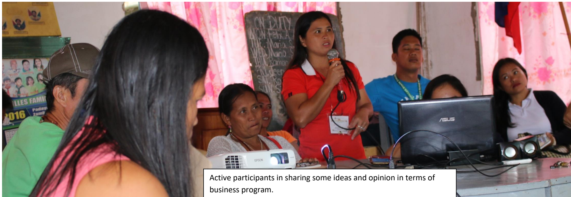
Active participants in sharing some ideas and opinion in terms of business program.