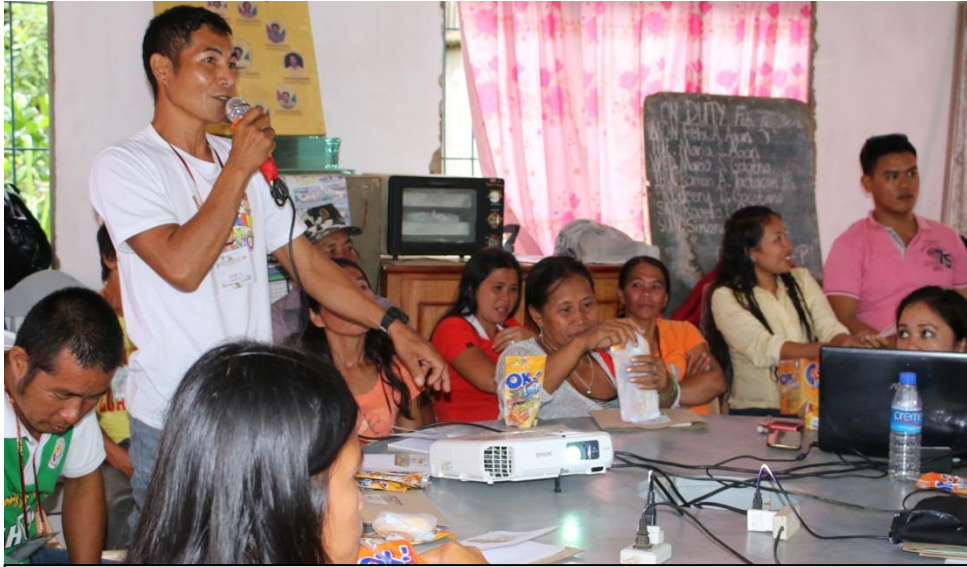
Active participants holding microphone, shared some good ideas and on how to implement the farmer's business program.