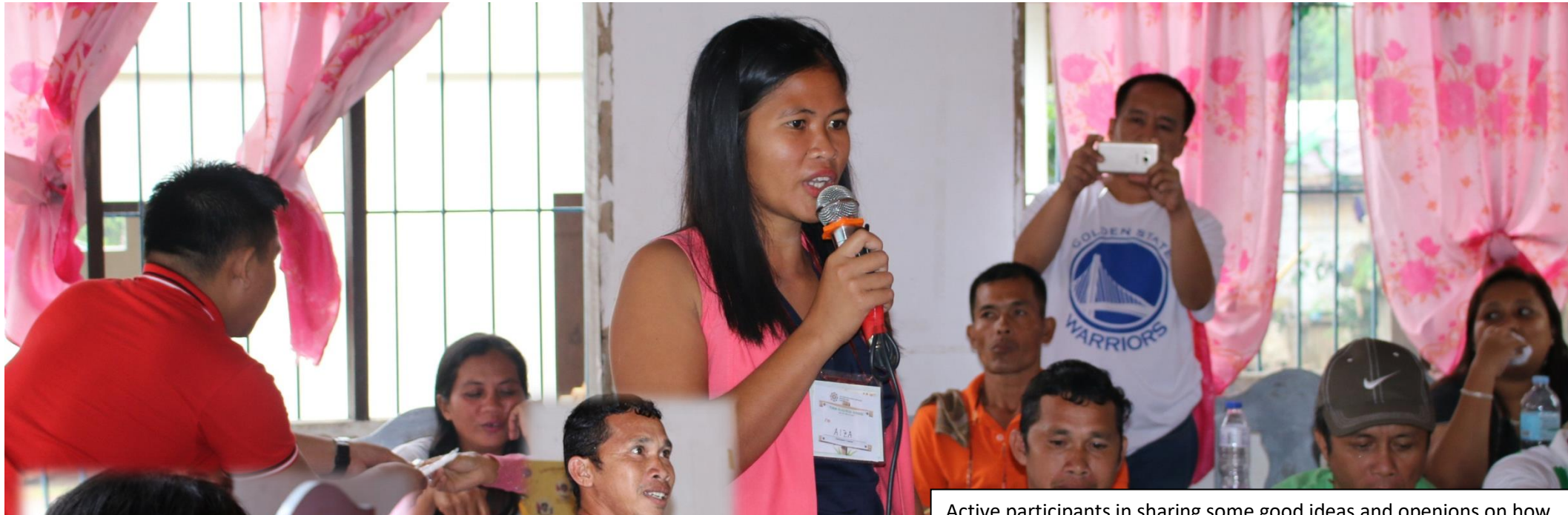
Active participants in sharing some good ideas and openions on how to implement the farmer's business program.