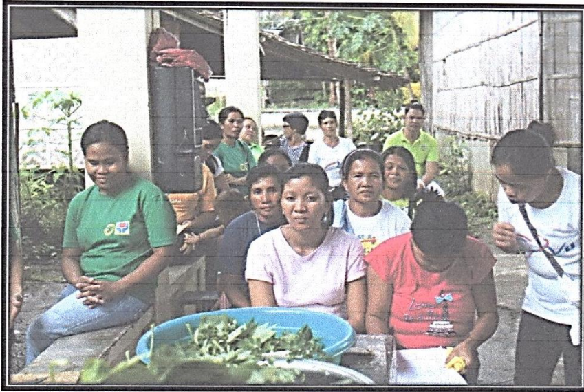
The WEM-RIC as the beneficiaries are listening on the procedure given by the research proponent.