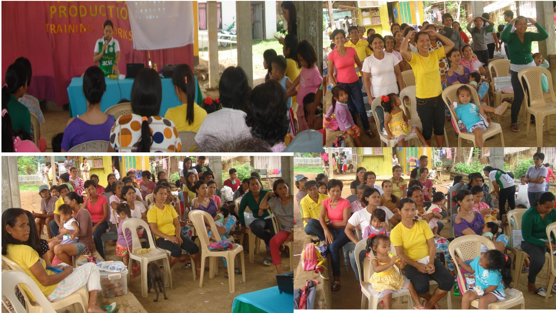
The Participants were actively participated and enjoyed the training.