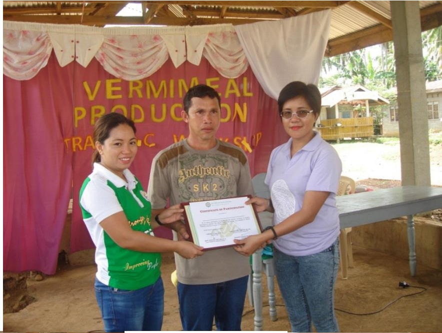
Giving of certificates