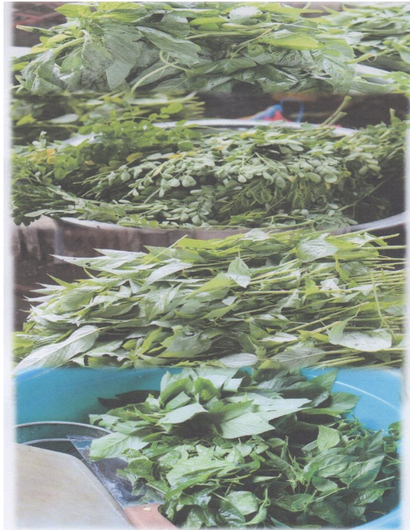
These are the fresh leafy ingredients (malunggay, saluyot, sili, and kulitis) ready for (decoction). Decoction -the leafy ingredients plus the twigs and roots are gently simmered for about 30 to 40 minutes in boiling water so as to release their properties.