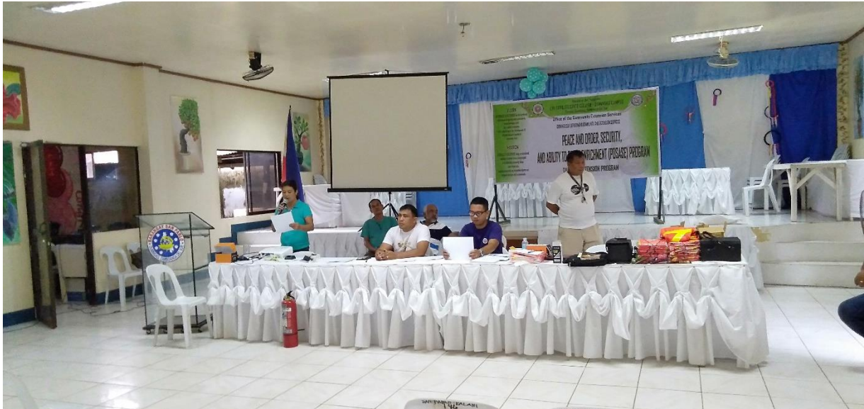
The Barangay secretary reads the MOA to the constituents of Barangay San Pedro during the MOA signing.