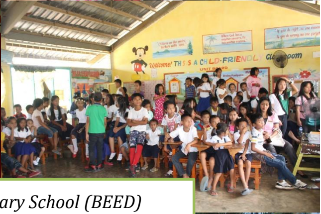
Extension Services Culmination Activity Laperian Elementary School (BEED)