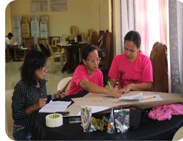
The WEMRIC- San Miguel presented their business plan.