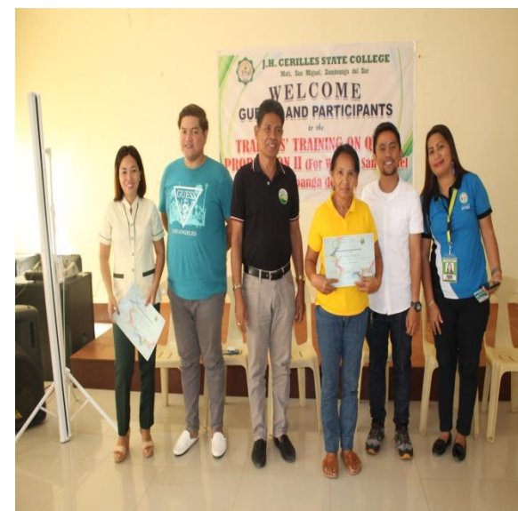
The giving of certificates to the WEMRIC participants.