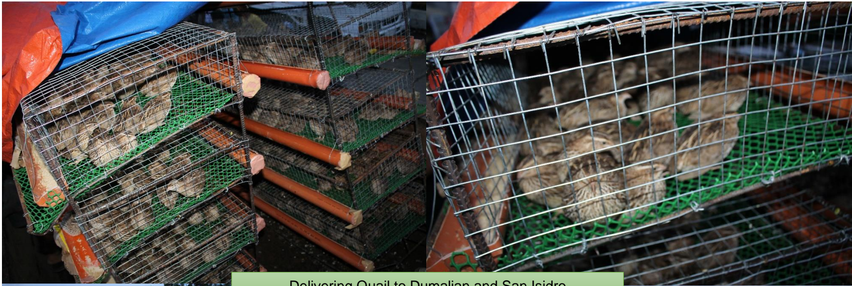
Delivering Quail to Dumalian and San Isidro